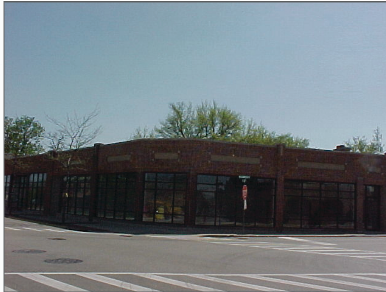
258 Green Bay Road • Highwood, Illinois 60040