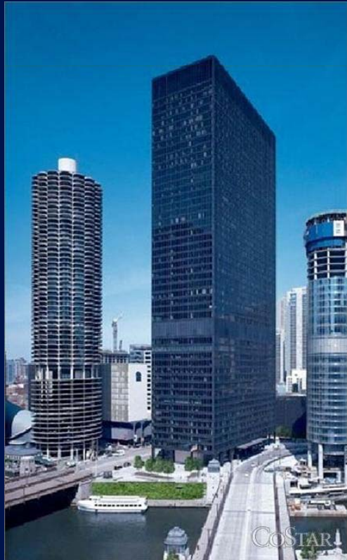
The IBM Building 330 N Wabash Ave Chicago IL.